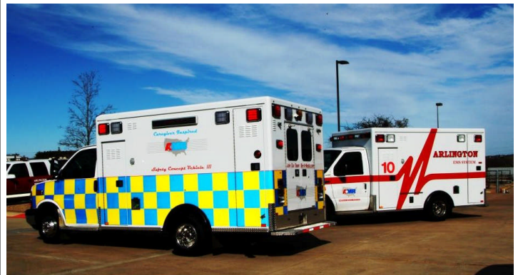
The new unit will be incorporated into the Arlington EMS system and road tested for one month