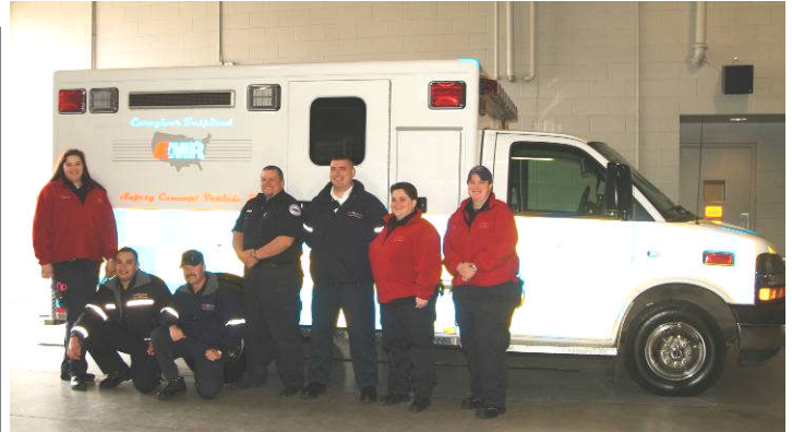
Arlington team members show off the new concept ambulance at a "roll out" event for the Fire Department, local hospital officials and media.

The new unit was unveiled for the Arlington Fire Department, local hospital/medical professionals and the media in January, providing up close inspection and instruction of the vehicle's capabilities and features.